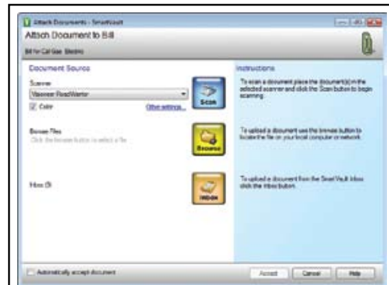
Scan and attach documents directly to QuickBooks entries to streamline document management.